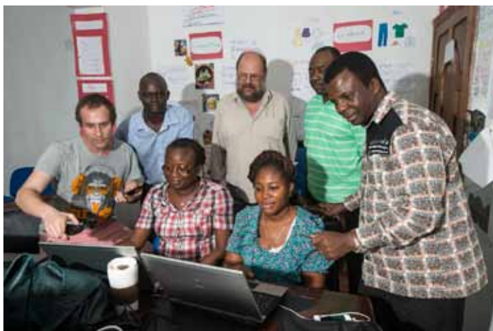
Balmed with FAO and Welthungerhilfe staff demonstrating system

Balmed has conducted a statistical survey on behalf of the Sierra Leone Government, FAO and Welthungerhilfe, to capture field data and capturing data using mobile applications and research software. Statistics have been used for Ebola conferences of FAO in Rome, as well as from the World bank in Washington and New York. Balmed will conduct long term statistical data capturing and analysis on behalf of the project. During the next weeks, Balmed will continue to capture field data on the impact of Ebola on farmers in rural areas using mobile applications. Balmed's IT systems are capable of tracking and tracing Ebola patients and deliver immediate responses by using mobile apps.