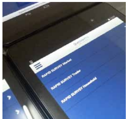
Survey tool on tablet